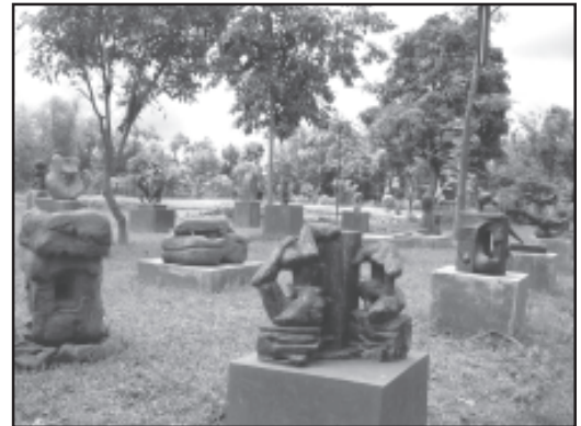
Exhibits at the Open Air Gallery of SACH.