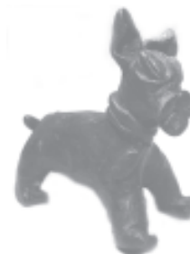
A dog toy cast in bronze