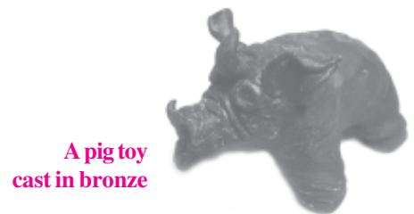
A pig toy cast in bronze