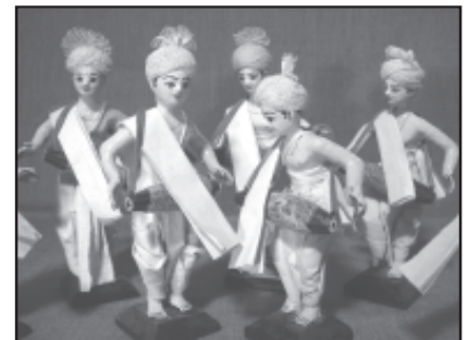
Rug dolls of Meitei pung drummers