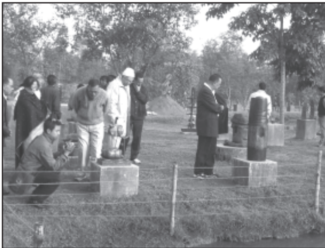
Guests viewing the exhibition of contemporary sculptures at the SACH Open Air Gallery.