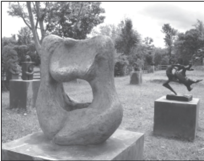
Exhibition of contemporary sculptures at the SACH Open Air Gallery.