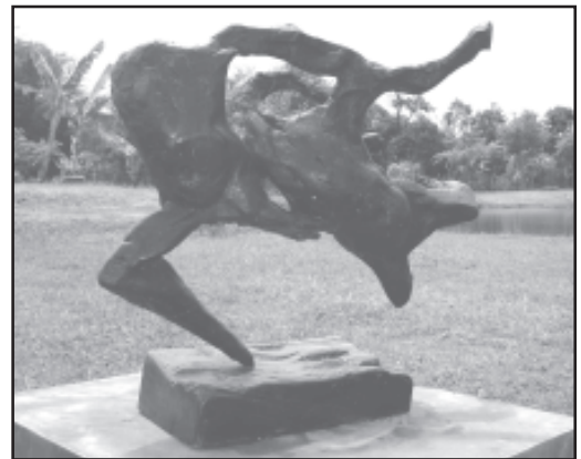
An exhibit at the Open Air Gallery of SACH.