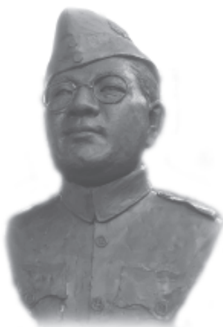
Bust of Netaji Subhash Chandra Bose