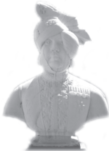
Bust of Churachand Maharajah at C.C.Higher Sec. School.