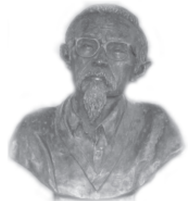
Bust of Arambam Samarendra