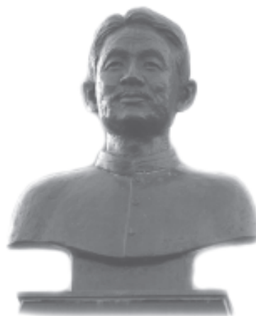
Bust of Mahakavi Angahal