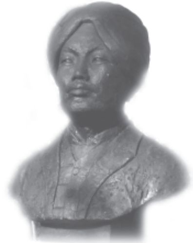
Bust of Bir Tikendrajit