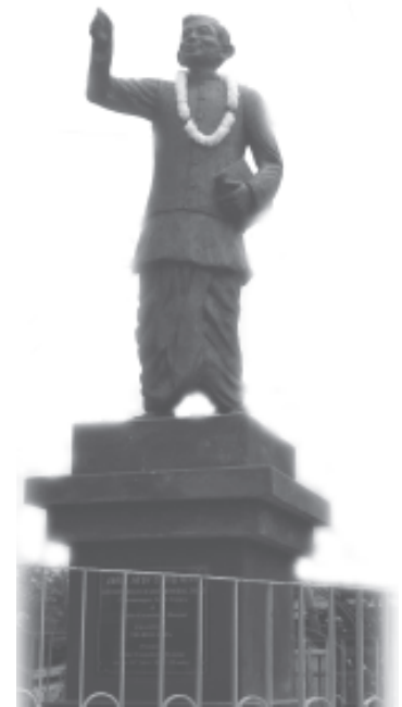
Statue of Jananeta Hijam Irabot at Dharmanagar (Tripura)